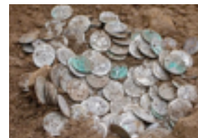
New & Old Treasure

So it will be at the close of the age. The angels will come out and separate the evil from the righteous and throw them in the fiery furnace.