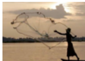
Parable of the Net

Again, it is like a merchant in search of fine pearls, who, on finding one pearl of great value, went and sold all he had and bought it.